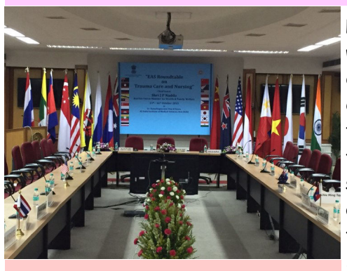
EAST ASIA SUMMIT

Live streaming or webcasting is a media presentation distributed or transmitted over the internet using streaming technology to distribute the content from a single source to many simultaneous