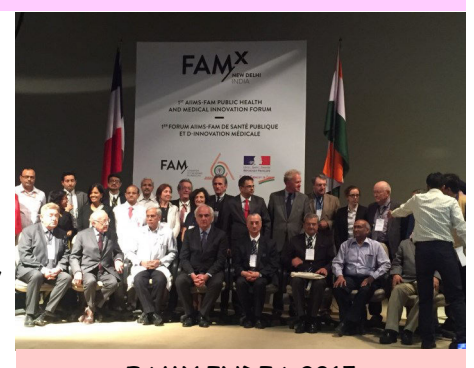
FAMX INDIA 2015

Computer facility has already done streaming of the 60th Institution Day of AIIMS,43 rd Annual Convocation of AIIMS East Asia Summit FAMX India 2015 and ANTC 2015.