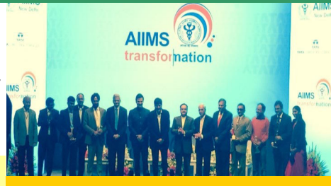
AIIMS Transformation team