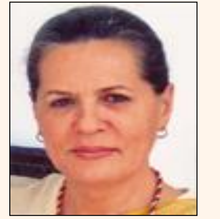
Hon'ble Chairperson, NAC