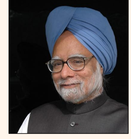
Hon'ble Prime Minister

Inauguration of: Convergence Block Free Generic Pharmacy Store